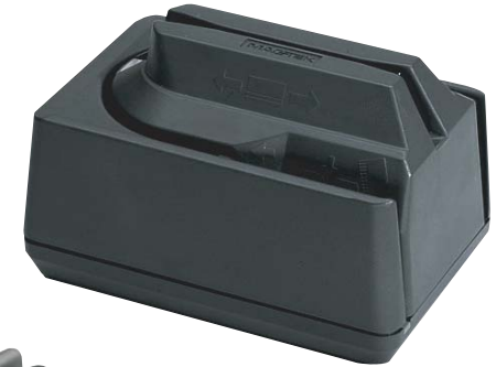
Mini MICR with MSR